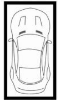
SECURE CAR SPACE APPROX. FLOOR AREA 15.0 SQ.M

TOTAL APPROX. FLOOR AREA 148.0 SQ.M. Measurements are approximate. Not to Scale. For illustrative purposes only. Produced by Open2View.com.au