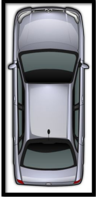
SECURE CAR SPACE APPROX. FLOOR AREA 15.0 SQ.M