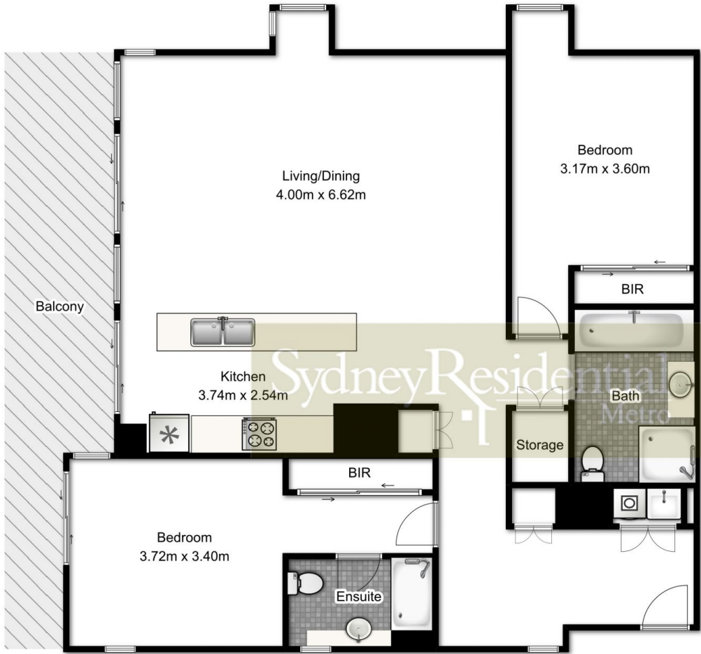
APARTMENT APPROX. FLOOR AREA 120.0 SQ.M.