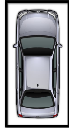
SECURE CAR SPACE APPROX. FLOOR AREA 14.0 SQ.M.

TOTAL APPROX. FLOOR AREA 107.0 SQ.M. Measurements are approximate. Not to Scale. For Illustrative purposes only.