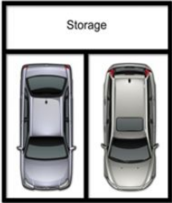
SECURE CAR SPACES & STORAGE APPROX. FLOOR AREA 40.0 SQ.M.

TOTAL APPROX. FLOOR AREA 282.0 SQ.M. Measurements are approximate. Not to Scale. For illustrative purposes only.