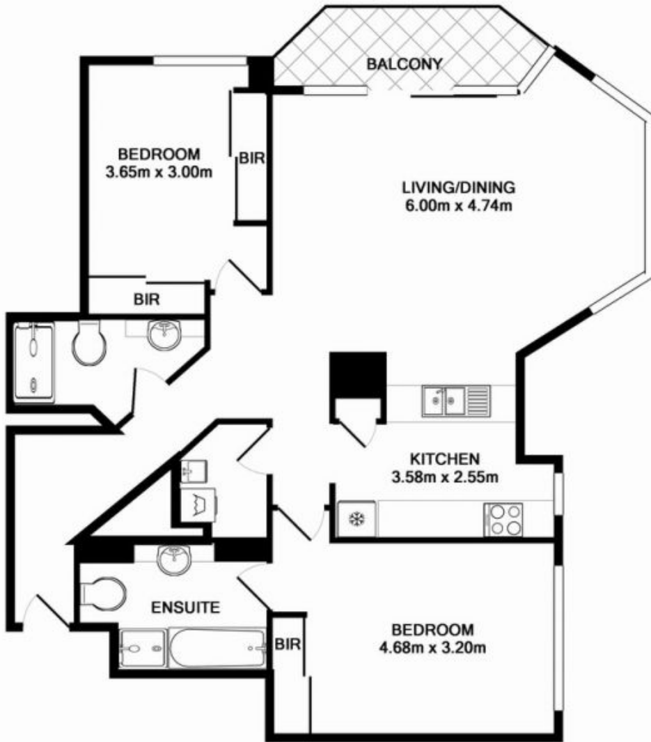
APARTMENT APPROX. FLOOR AREA 100.0 SQ.M.