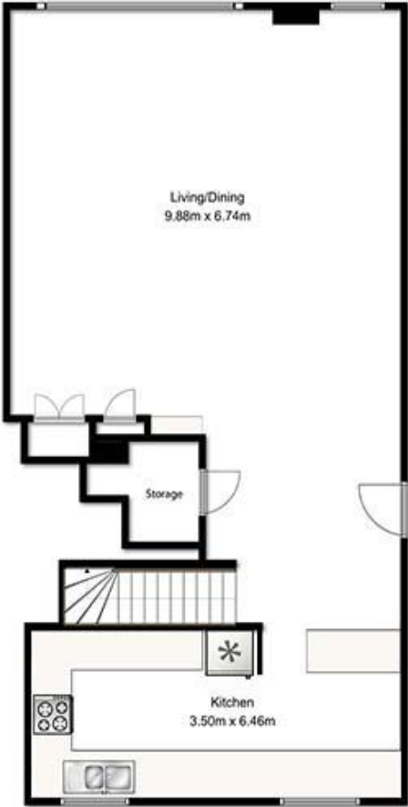
ENTRANCE LEVEL APPROX. FLOOR AREA 85.0 SQ.M.