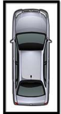
SECURE CAR SPACE APPROX. FLOOR AREA 13.0 SQ.M.