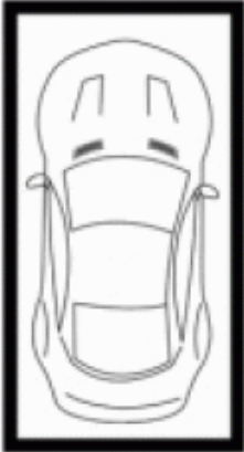
LUG APPROX. FLOOR AREA 15.0 SQ.M