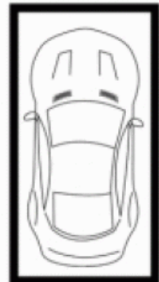
LUG APPROX. FLOOR AREA 15.0 SQ.M