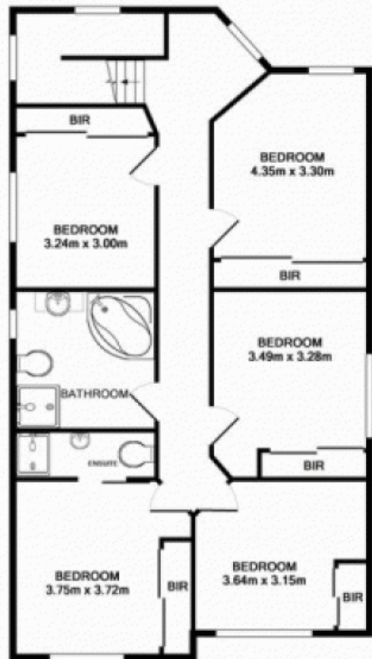
1ST FLOOR APPROX. FLOOR AREA 96.4 SQ.M.