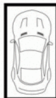
CAR SPACE APPROX. FLOOR AREA 19.0 SQ.M.