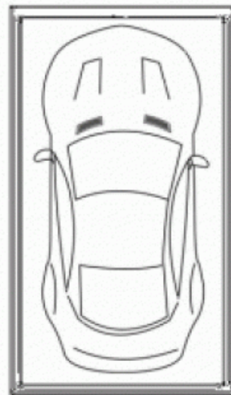
LUG APPROX. FLOOR AREA 14.0 SQ.M.