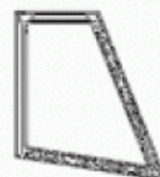
STORAGE APPROX. FLOOR AREA 2.0 SQ.M