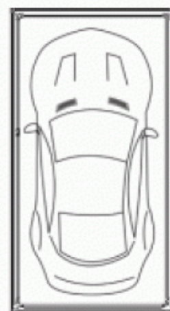
SECURE CAR SPACE APPROX. FLOOR AREA 13.0 SQ.M