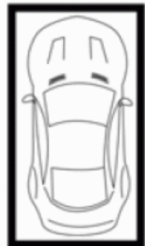
SECURE CAR SPACE APPROX. FLOOR AREA 20.0 SQ.M.