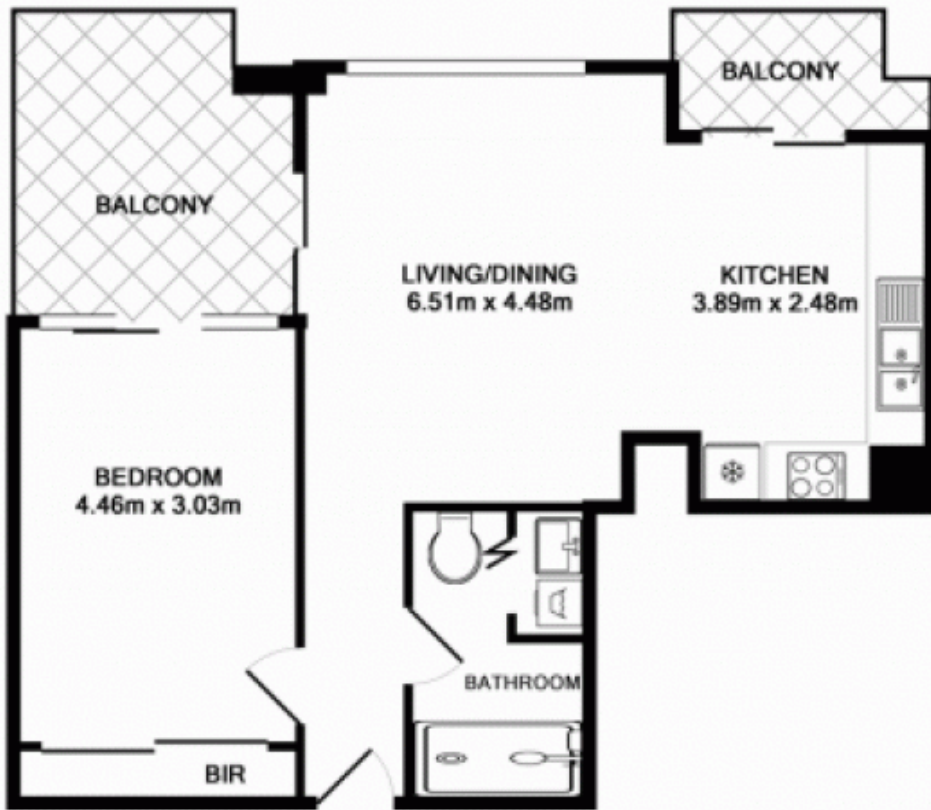
APARTMENT APPROX. FLOOR AREA 64.0 SQ.M.